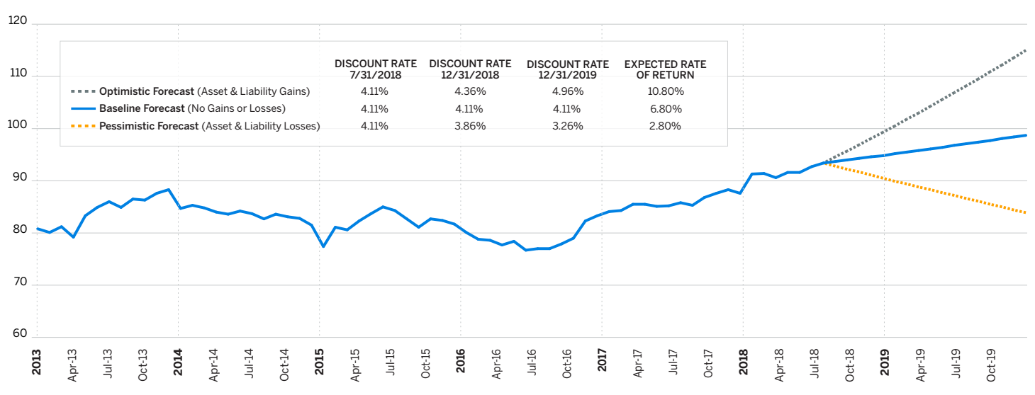
FIGURE 2: MILLIMAN 100 PENSION FUNDING INDEX - PENSION FUNDED RATIO