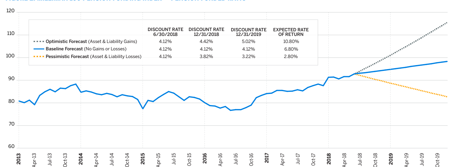
FIGURE 2: MILLIMAN 100 PENSION FUNDING INDEX — PENSION FUNDED RATIO

Over the last 12 months (July 2017 – June 2018), the cumulative asset return for these pensions has been 5.39% and the Milliman 100 PFI funded status deficit has improved by $138 billion. The primary reason for the increase in the funded status deficit was discount rate gains over the past 12 months. Discount rates have risen from 3.74% as of June 30, 2017 to 4.12% a year later. The funded ratio of the Milliman 100 companies has increased over the past 12 months to 92.8% from 85.2%.