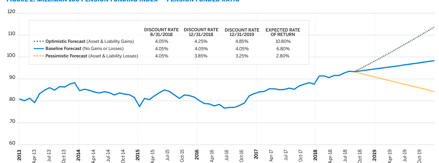
FIGURE 2: MILLIMAN 100 PENSION FUNDING INDEX — PENSION FUNDED RATIO