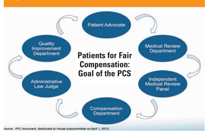
Figure 1 How Would It Work?

pensation made under Florida's PCS will not have to be reported to the NPDB.