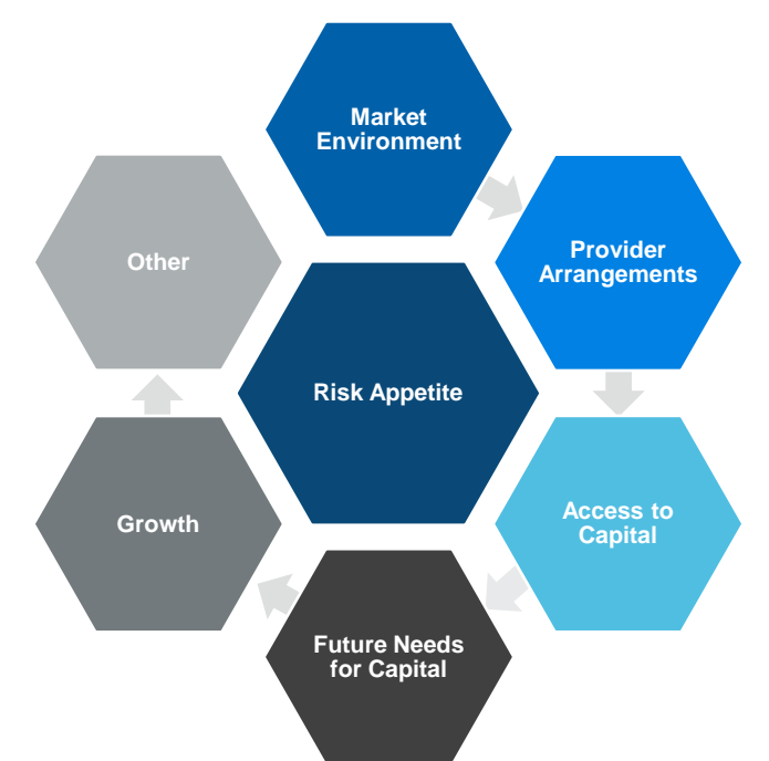
FIGURE 3: CONSIDERATIONS WHEN DETERMINING TARGET SURPLUS

There is no "correct answer" or "one size fits all" with regard to the appropriate target surplus level for a given company; therefore, actuaries must consider several factors when determining the appropriate level of surplus through capital adequacy studies. Any reasonable capital adequacy assessment involves projecting surplus over a time horizon (typically five or more years) by running numerous simulations, as well as varying certain key variables that affect the company's net income. The target surplus is generally the level at which the probability of a company going insolvent over the selected time horizon is less than the threshold the company's management feels comfortable with. Some of the significant considerations when performing capital adequacy assessments are described in this section.