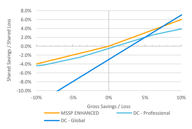
FIGURE 13: SHARED SAVINGS/LOSSES BY THREE MODELS AND TRACKS

Perhaps what stands out the most in Figure 13 is comparing the effect of the discount/guality withhold between the three options. CMS states in the RFA that a 2% discount (or the applicable discount for a given performance year) is necessary to allow CMS to achieve first-dollar savings before the ACO retains 100% of savings above the discount (and any unearned quality withhold). In reality, the discount moves the benchmark, meaning that modest savings of less than 2% will actually result in shared losses for the DCE. In this scenario, a DCE would need to achieve gross savings of nearly 8% for the financial result to be more favorable under the Global option than MSSP ENHANCED. For modest rates of gross savings/losses and achievement of quality goals, the financial outcomes for the ENHANCED track and Direct Contracting Professional track are comparable. This analysis excludes the effect of some potentially important methodological differences between DC and MSSP, such as differences in regional adjustments and risk adjustment. The effects of those methodological differences are not known due to a lack of details released by CMS as of the time of publication of this white paper.