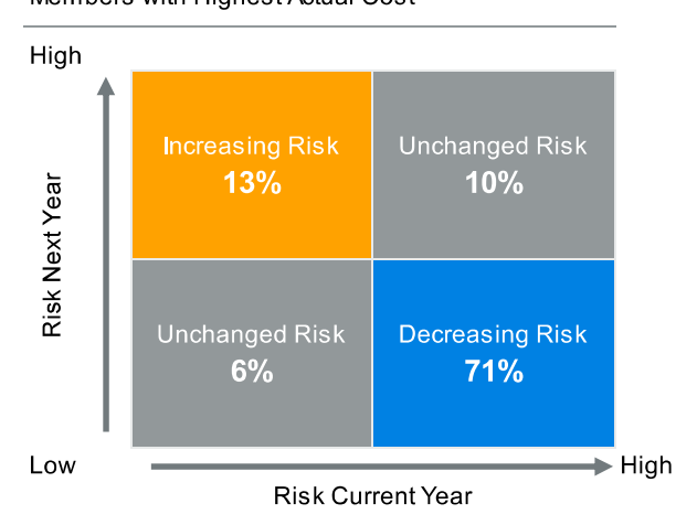
Method 2: Members with Highest Prospective Risk Score