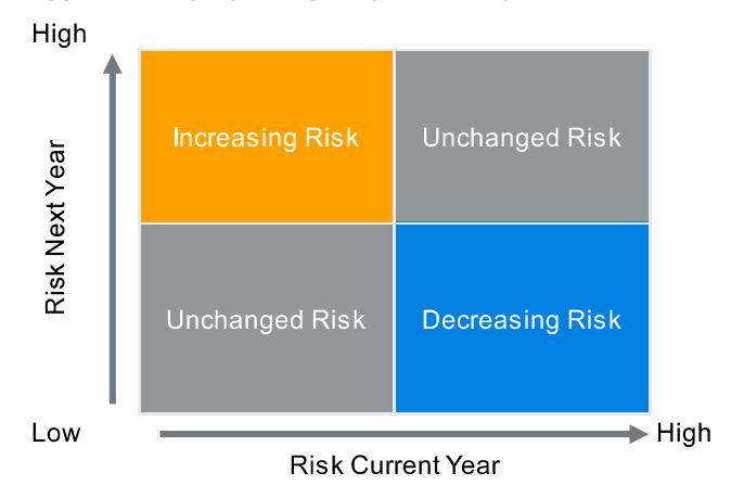
FIGURE 1: TRANSITION IN RISK FROM YEAR 1 TO YEAR 2

A common approach for identifying members for care management and interventions is to focus on the members who are currently high-cost, or expected to be high-cost next year (by using prospective risk adjustment scores). Both approaches cast a wide net that capture both quadrants on the right side of the chart—high-risk members whose risks will be largely the same next year, and members who are currently high-cost but will revert to the mean by next year (decreasing risk cohort). A more refined approach would be to aim to maximize the proportion of members in the top two quadrants—those whose risks will be increasing next year (top left) and high-risk members whose risks will be largely the same next year (top right). There are many existing tools to help care coordinators identify high-cost complex case members in order to reduce the persistent cost levels and prevent further deterioration, but the ultimate goal in care management has been finding the rising risk cohort of the population, implementing early interventions to focus on those members with increasing risk and addressing their additional healthcare needs before their costs escalate.