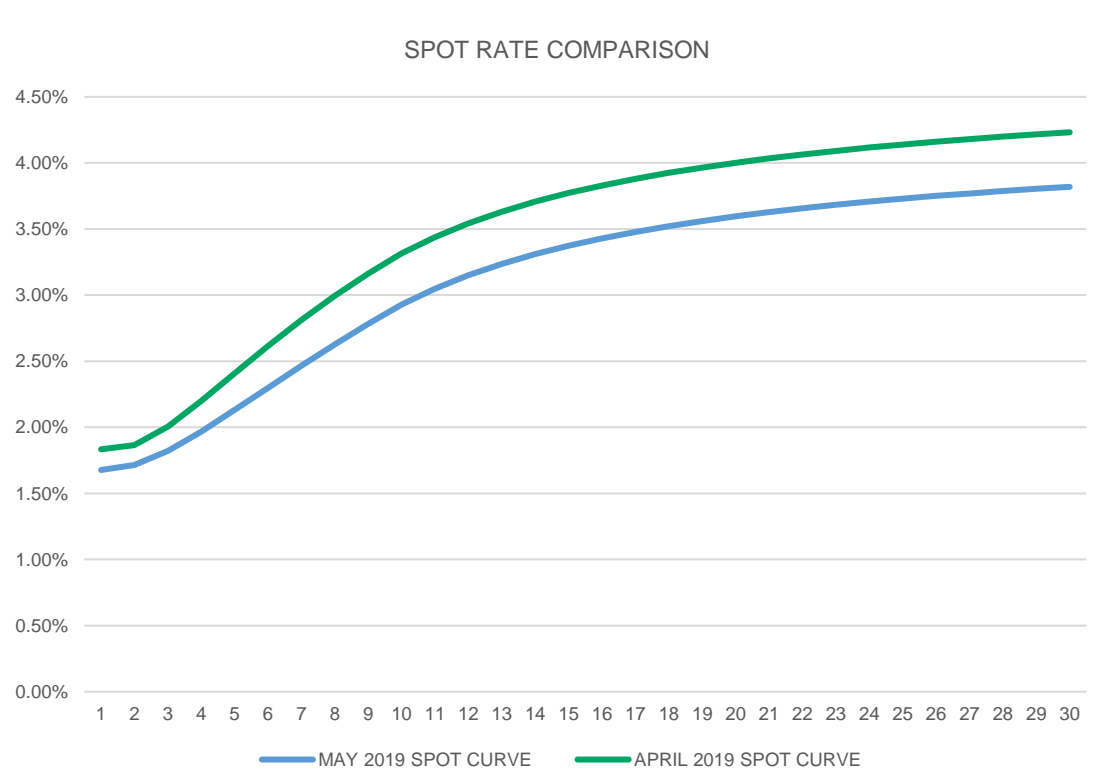
FIGURE 9: SPOT RATE CURVES RELATIVE TO PRIOR PERIOD FITTED CURVE